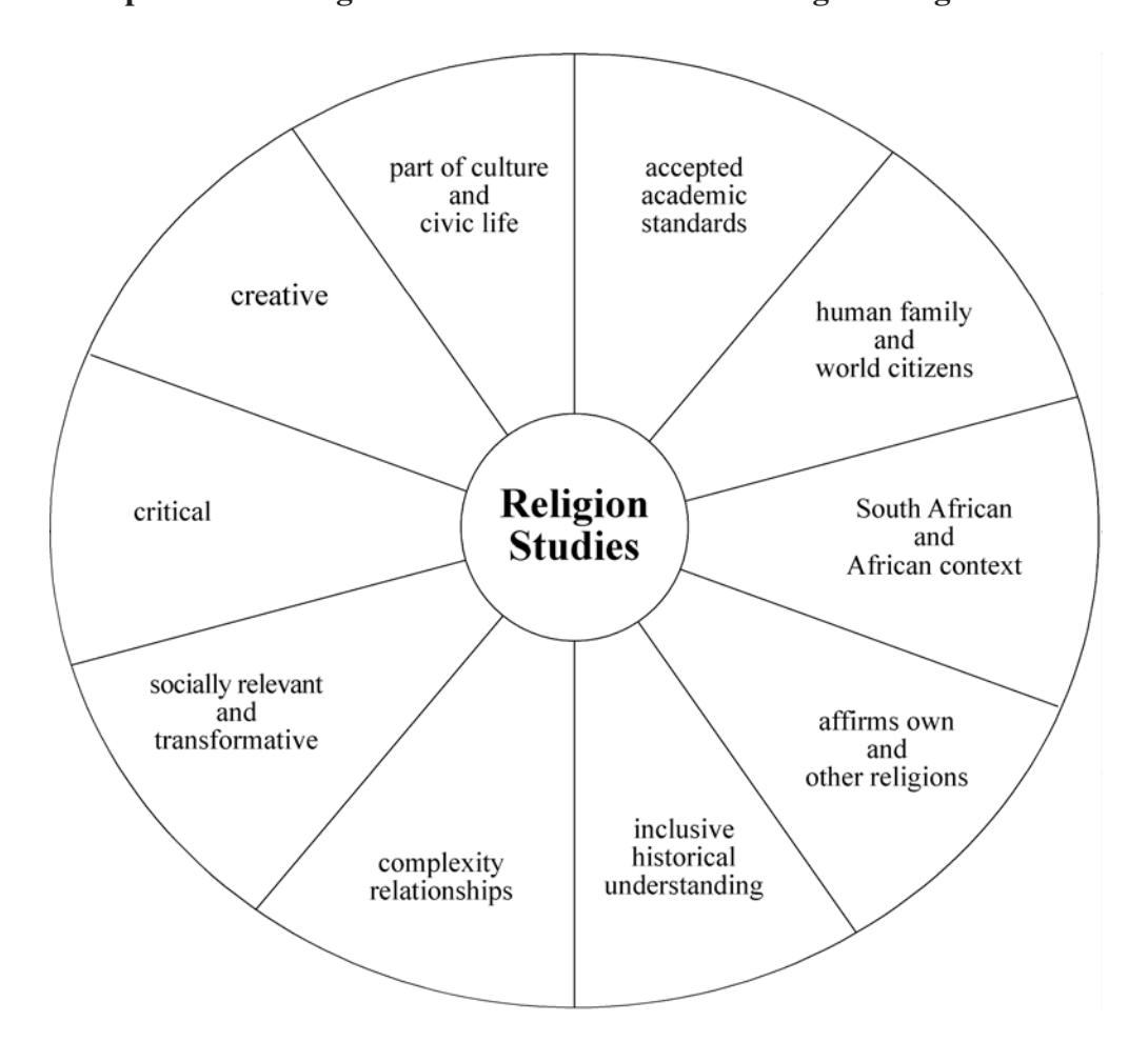
Figure 2.1 Principles structuring the attainment of understanding in Religion Studies