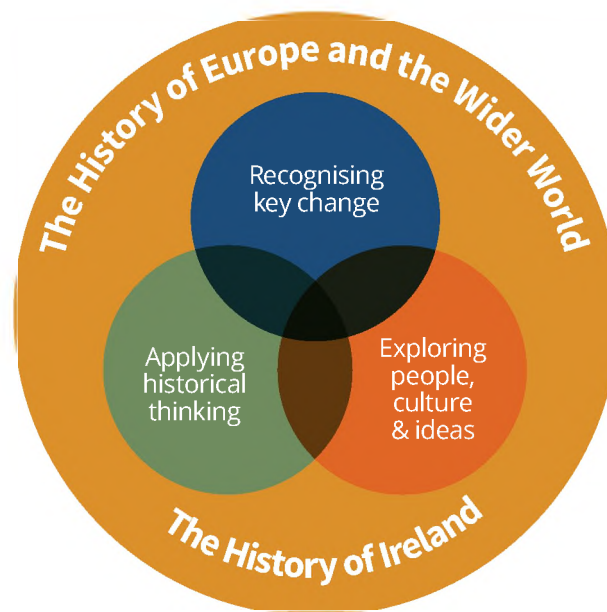
Figure 3: The elements of strands 2 and 3: The history of Ireland and The history of Europe and the wider world

There are three interrelated elements to strands 2 and 3: