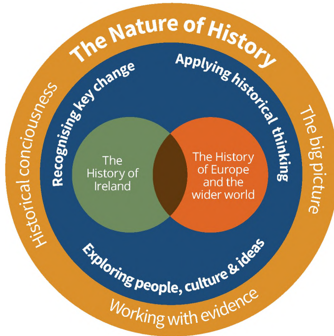
Figure 4: Overview of Junior Cycle History: The interaction between strands 1, 2 and 3 Progression from primary to senior cycle