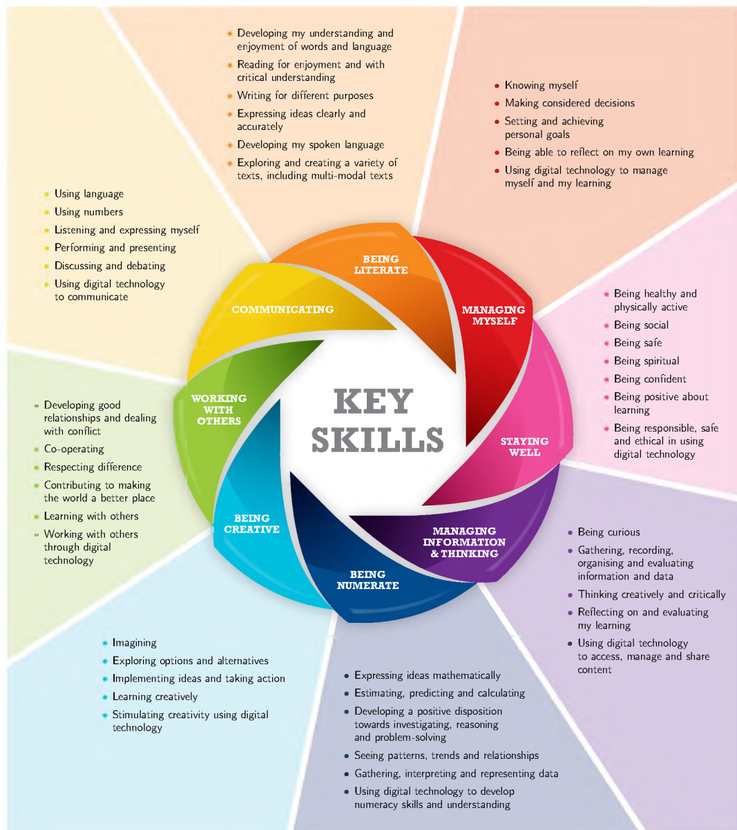
Figure 1: The elements of the eight key skills of junior cycle

In addition to their specific content and knowledge, the subjects and short courses of junior cycle provide students with opportunities to develop a range of key skills. Figure 1 below illustrates the key skills of junior cycle. There are opportunities to support all key skills in this course but some are particularly significant.